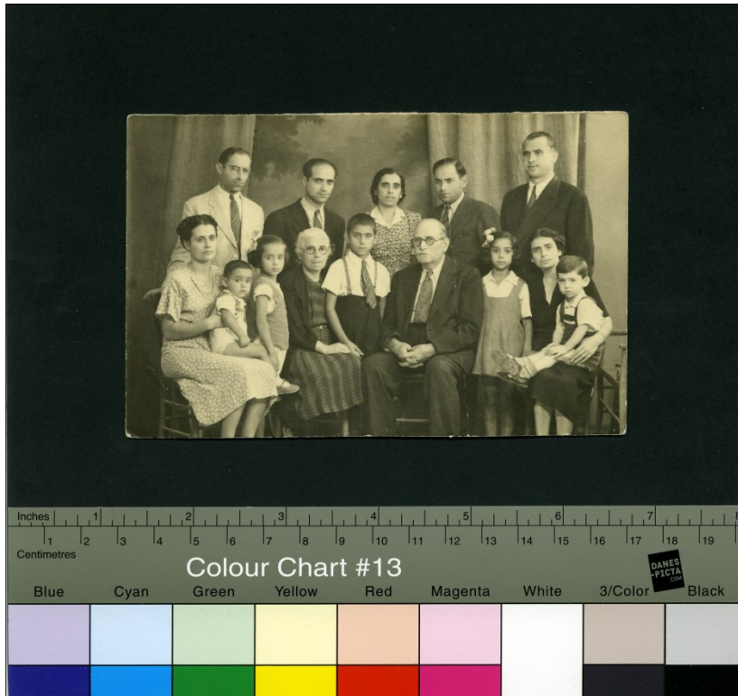
Pic. 4. Photo of the Armenian Pentecostal family of Kuriyan. Town of Sliven, South Bulgaria, 1940s.