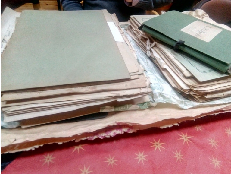
Pic. 6. Photo of archive of the Evangelical Episcopal Methodist Church ‘Dr. Albert Long’ in Sofia, February 2019.