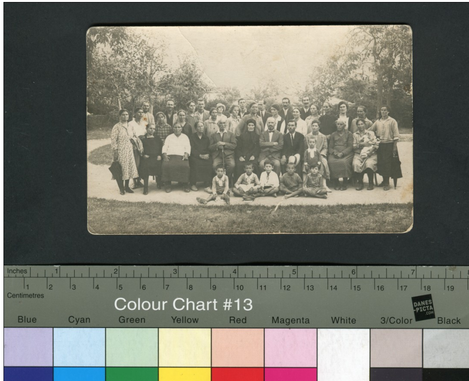
Pic.2. This photo presents one of the first Seventh-day Adventist society in Varna, Northeast Bulgaria, 1920s.