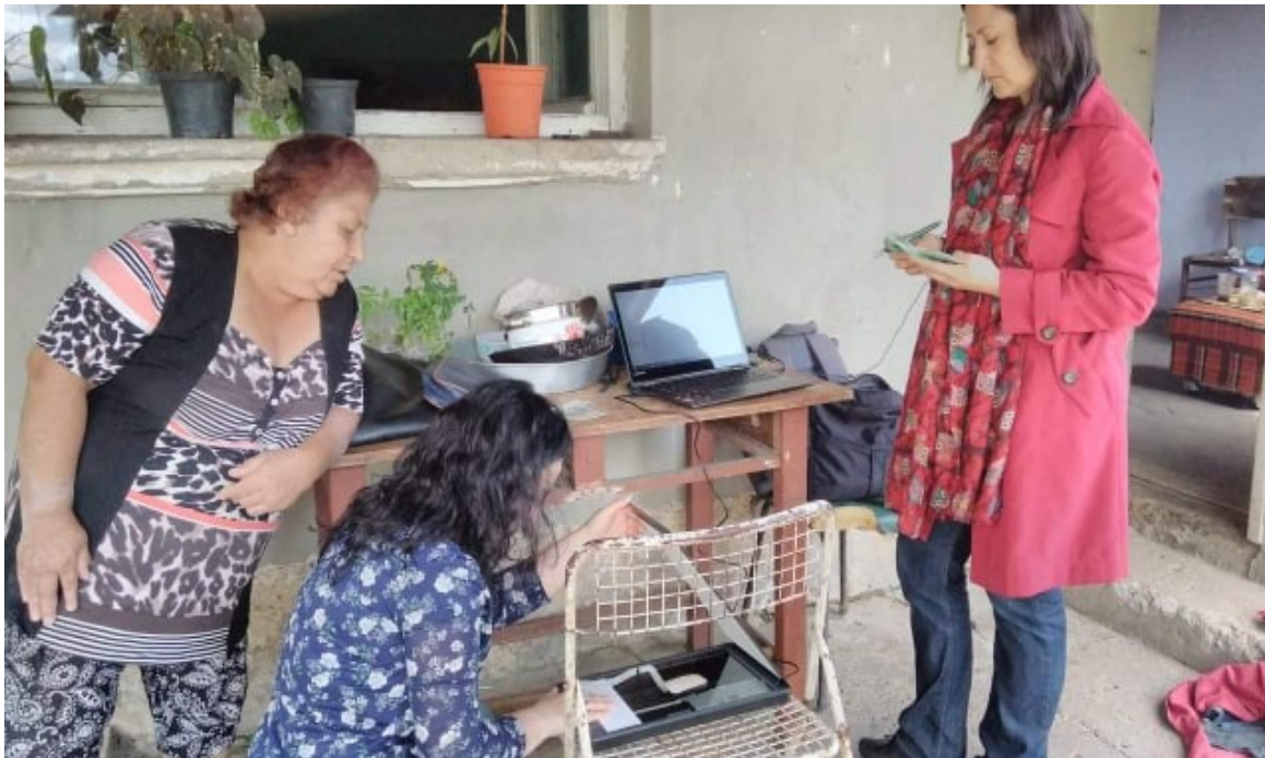
Pic. 7. Fieldwork in Montana region, Northwest Bulgaria. Interview with Romani Baptist believer and digitalisation of her photographic collection, May 2019.