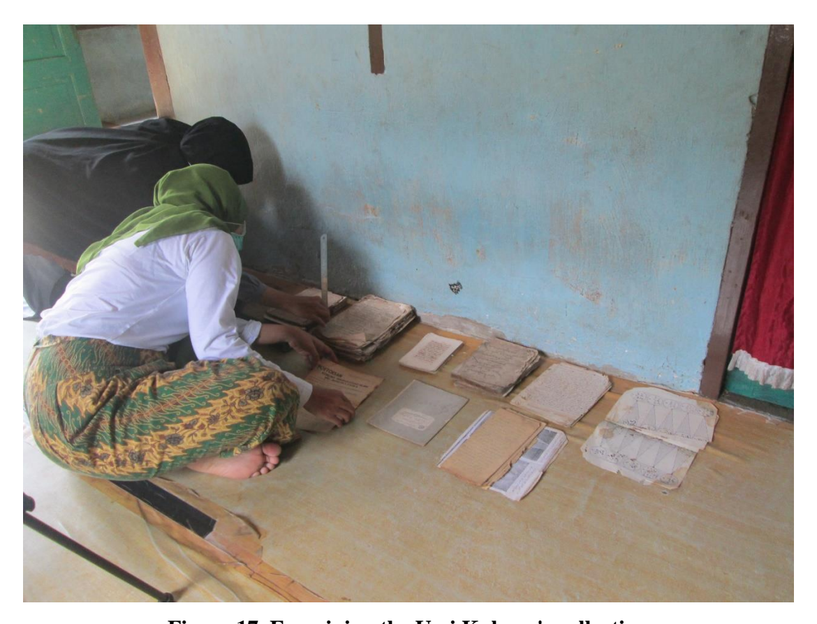
Figure 17. Examining the Umi Kulsum's collection