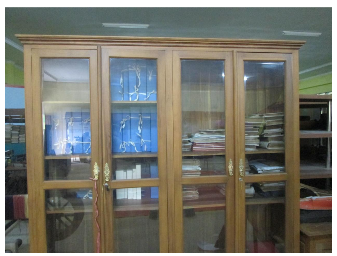
Figure 13. Collection in Museum

It is the Tafsir (translation) of Al Qur'an. Cover is made of cardboard with yellow color while the content written in laid paper. Its size is 33 \times 20.6 cm written Arabic.