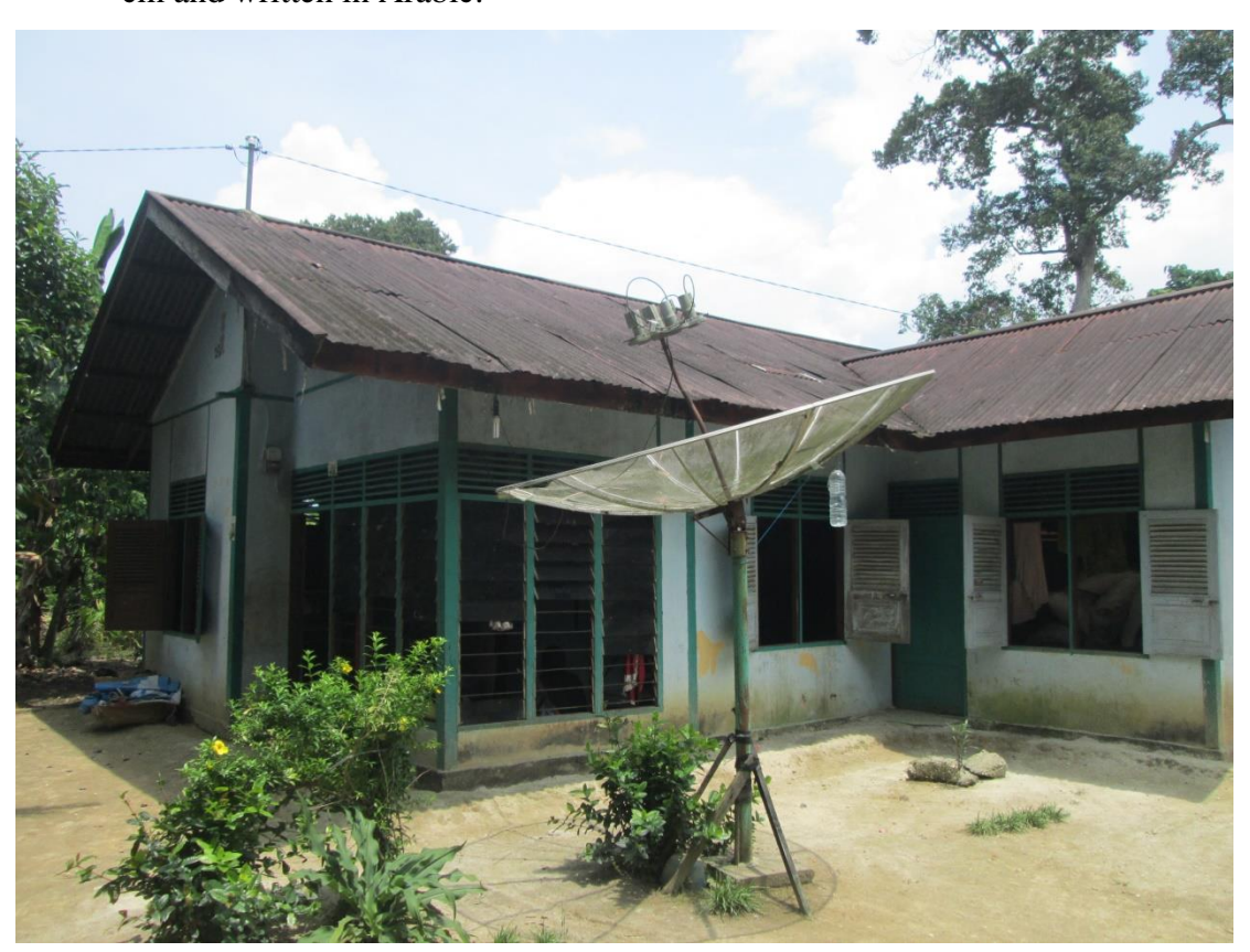
Figure 15. Umi Kulsum's house

The manuscript contains tahlil. It is made of lined paper. Its size is 20.7 \times 16.6 cm and written in Arabic.