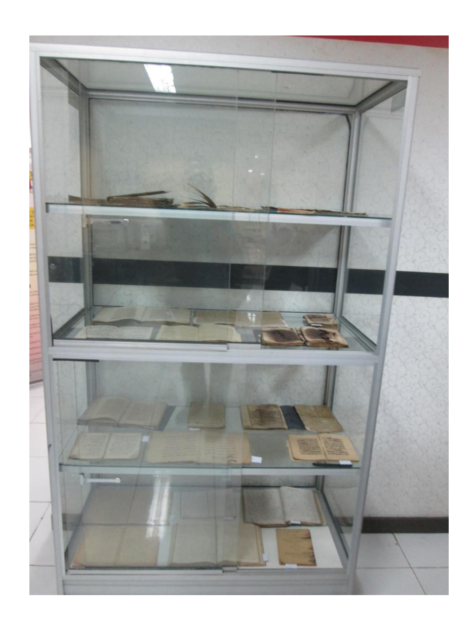
Figure 19. The collection of Minangkabau Corner