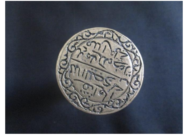
Figure 4. The stamp, one of the Bonsu Ani's Collection.