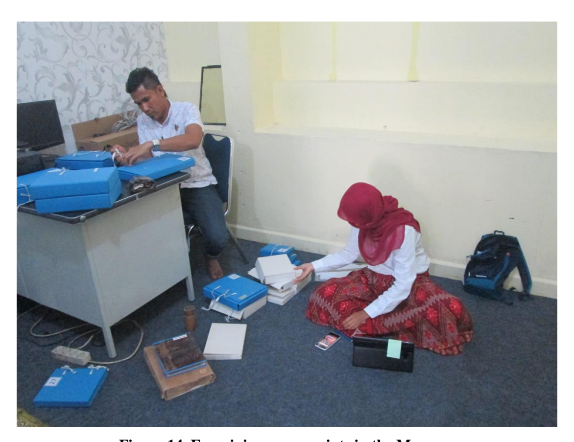
Figure 14. Examining manuscripts in the Museum